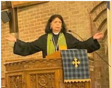
"Remember Who You Are"