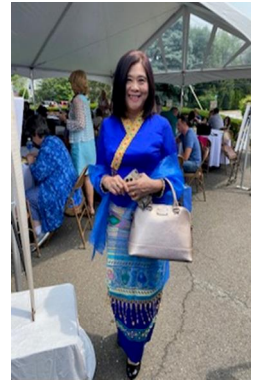
A wonderful day full of faith, food and fellowship was enjoyed by over 150 people!