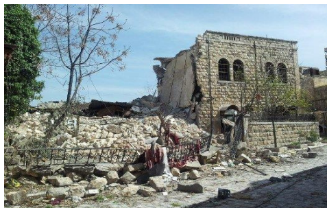
The Presbyterian Church of Aleppo, Syria, was organized in 1853.