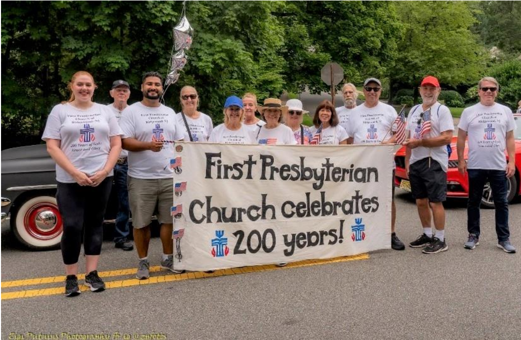
When First Pres participated in Ridgewood’s July 4 th parade!